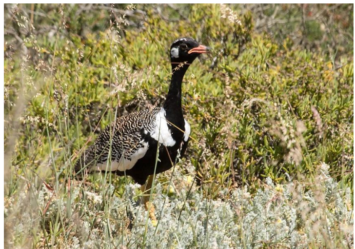
Black Bustard

The route quickly gives way to the thorny succulents and low scrub typical of the vast flat region ahead of us known as the Tanqua Karoo. Seemingly stretching almost to infinity, this is one of the most unique South African environments, partially due to the dominance of low-growing succulent plants. Here the rugged Cape mountains block the moisture coming from the ocean, creating near desert-like conditions in their rain shadow. Rainfall is highly irregular, but if we are lucky the winter rains will have reached the area. When they do, the birds respond by moving in and displaying and nesting in abundance. Just as alluring as the birdlife is the potential for one of the