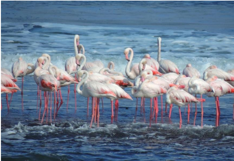
Greater Flamingos

habitats here include open water, shoreline and tidal flats, and marshes and reedbeds. Although they move around, a variety of African waterbirds and migrant shorebirds can always be found in this area, including both Greater and Lesser flamingos, plus we may find some of the specialized inhabitants of the marshes like the African Marsh-Harrier, African Snipe, Levillant's Cisticola, Cape Weaver and Southern Red Bishop.