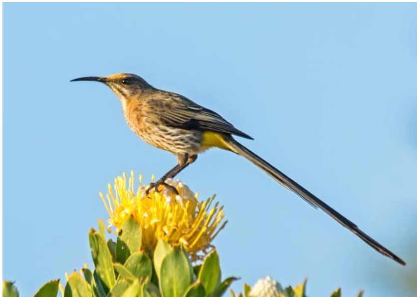
Cape Sugarbird

Our first week will be spent in the spectacular southwestern Cape, with its near-perfect Mediterranean climate and world-renowned flora. Endemism is the key word here, and because of its complex geography and long isolation, this region is home to a truly amazing number of birds, plants and animals that are found nowhere else. Unique environments that we visit include the twisted and folded mountains that plunge to the sea, protected patches of native prairie and fynbos scrub (literally “fine bush”), and the interior semi-deserts of the Karoo.