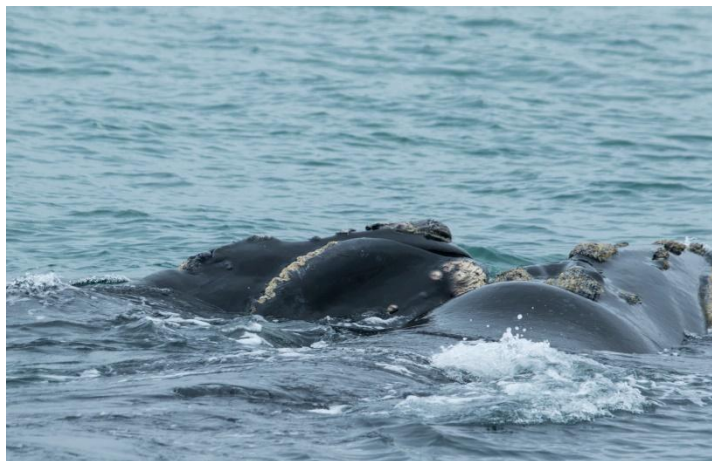
Southern Right Whale cow & calf

September 28, Day 10: Hermanus to Cape Town. After breakfast we will board a special whale-watching boat and head out into the bay in search of Southern Right Whales, our prime objective for the morning. After the boat trip we will head to Stony Point for close-up views of the comical Jackass (African) Penguins at one of their few breeding colonies on the mainland. This well-managed reserve is also home to all four of South Africa's marine cormorants: Bank, (endangered), Crowned, Cape and Great, as well as African Oystercatchers. A final afternoon stroll will find us searching the rocky slopes for the iconic and elusive Cape Rockjumper, one of the most distinctive of the southwestern Cape endemics. Also possible in