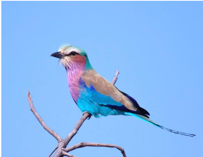
Lilac-breasted Roller

October 3-4: Kruger to Johannesburg; Departure for Home or Begin Wakkerstroom Extension. After a final morning game drive, we will connect with a domestic flight back to Johannesburg. Participants not continuing on the Wakkerstroom Extension will arrive at the Johannesburg airport in time for evening departures to Atlanta, New York Kennedy, Washington Dulles, Amsterdam, London and Frankfurt which will arrive on October 4, allowing time for onward connections.