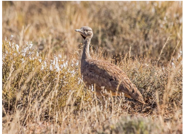
Karoo Bustard

September 26, Day 8: The Tanqua Karoo. We have a full day to explore the Karoo environs, systematically working our way through the various micro-habitats in search of the bird specialties unique to the region. Here the bushes are low, scrubby and widely-spaced, with sparse grasslands in-between and only scattered clumps of small trees and brush along the usually dry watercourses. A surprising number of “hard-to-find” specialties are resident in this environment, including Pale Chanting-Goshawk, Karoo Bustard, several larks, Fairy Flycatcher, Greater Kestrel, Rufous-eared Warbler, Namaqua Warbler, Yellow-rumped Eremomela and Layard’s Warbler. Other birds more typical of the still-drier Kalahari and Namib deserts—such as the