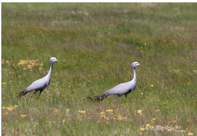
Blue Cranes

We have a full day to explore the various habitats in the Wakkerstroom area, searching the grasslands for special endemics like Southern Bald Ibis, Blue Bustard, Rudd’s and Botha’s larks (both very rare and secretive, with tiny world ranges), and Yellow-breasted Pipit. Rocky areas and eroded ridges and hillsides could produce Ground Woodpecker, Wailing Cisticola, Sentinel Rock-Thrush, Buff-streaked Chat, Yellow-tufted Pipit and Cape Bunting. Small, relict patches of forest could produce a Bush Blackcap or Barratt’s Warbler (both tricky), plus a variety of robin-chats and bush-shrikes. Other less range-restricted specialties of the area