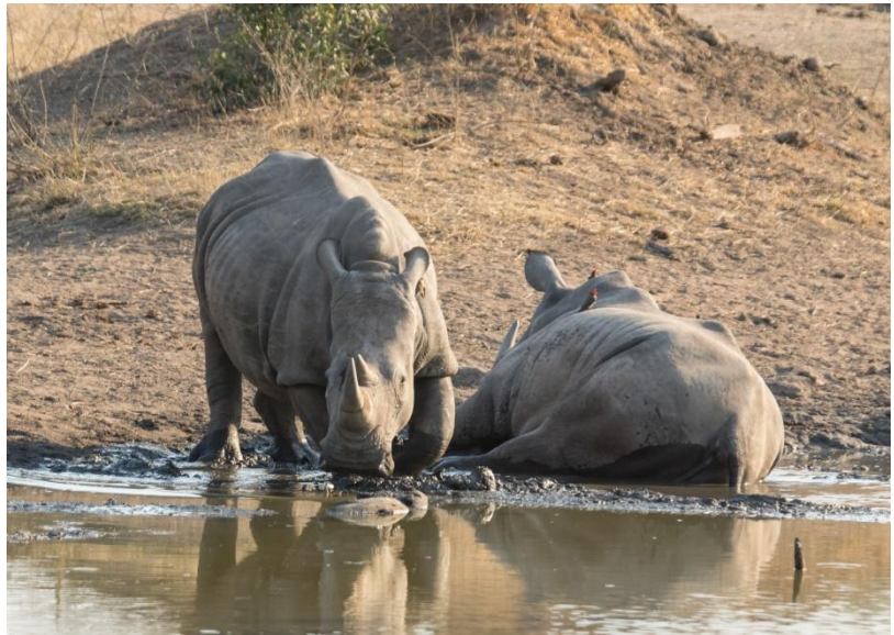
White Rhinoceros

We have three nights at Nyati, and our stay will follow the classic African safari schedule – an early morning wake-up call, followed by tea/coffee and a light breakfast. We then head out on our morning game drive - searching