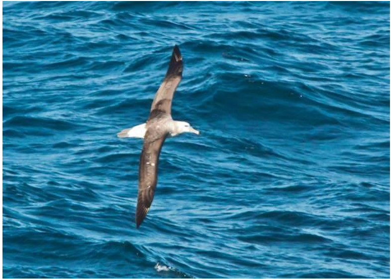
White-capped (Shy) Albatross

Depending upon weather and sea conditions, today we will set out on a pelagic trip from the west coast of the Cape. Here the cold Benguela current sweeps northward, causing strong upwellings of nutrient-rich waters that support an abundance of marine life. The pelagic birding here is simply spectacular, and it is not unusual to see 20 or more species offshore in a day. The numbers can be incredible and among the commoner species are Black-browed and White-capped (Shy) albatrosses, Cape and White-chinned petrels, Sooty Shearwater, Cape Gannet and Kelp Gull.