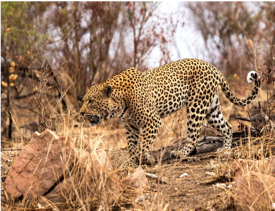
Male Leopard

An added bonus to a visit to South Africa is the great infrastructure for tourism. This agricultural and industrial giant is the only truly modern country on the continent, and the accommodations, food and other facilities are excellent, while health problems are almost non-existent. Expert local leadership, an extensive system of parks and reserves, and a wealth of printed materials on the birds and other aspects of natural history add to the pleasure of visiting this very unique part of the continent. This tour promises some of the very best of South Africa, in a productive, yet reasonably paced, itinerary.